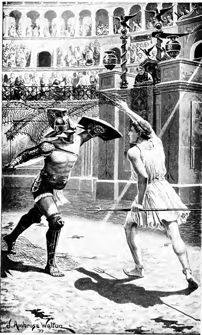
" The Briton dashed in."